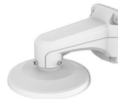
A78 Recessed Mount